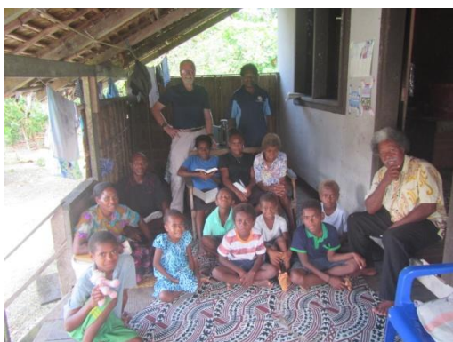
The small Nanguu village congregation