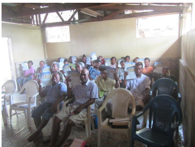
The Honiara church of Christ with their House to House magazines.